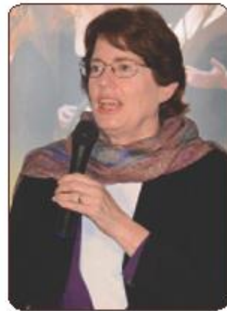
presented by Sherry WEDDELL

October 15, 2016 • 8:45 a.m. - 3:15 p.m. (registration begins at 8:15 a.m.)