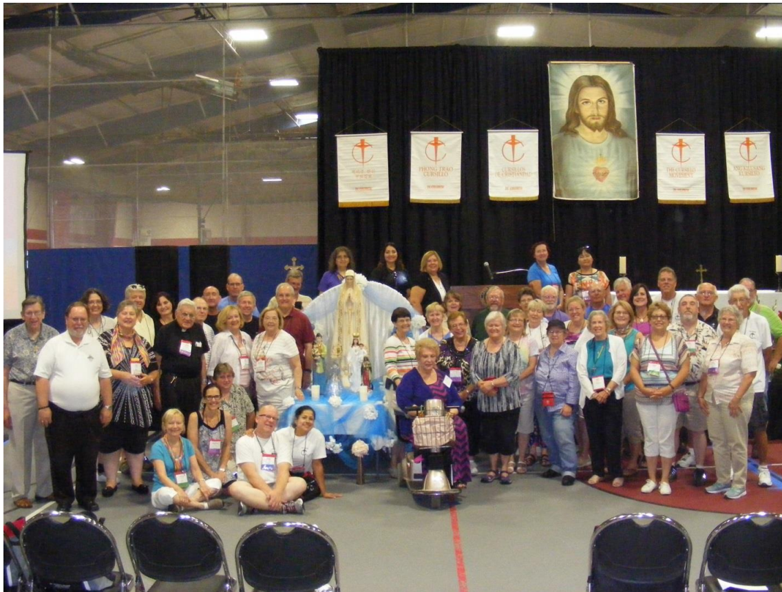
On Saturday afternoon the General session recessed and each regional by language. Above is a picture of most of Region V.