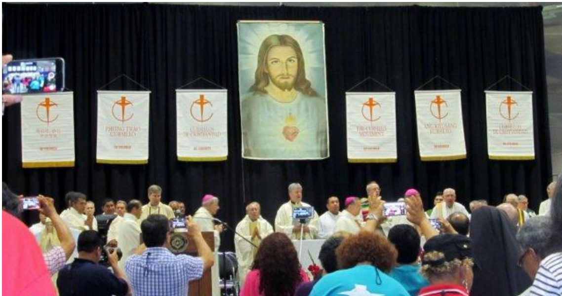
Procession of 3 Bishops, 24 Priests and 24 Deacons before Mass at the 26th National Cursillo Encounter. Banners in the background represent the various languages of Cursillistas in the National Cursillo Movement.

Answer to the above question: Trinity (3), Mary (Jesus’ Mother), all the Saints and Angels. Did you ever stop to think when we group/pray how many others are present, helping us along in our journey in life?